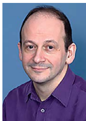
Prof. Dr. Mike Crang | Durham University

Capital is congealed labour, said Marx. But things and objects in economies are actually stabilisations and congealings in many dimensions. The temporal (and spatial) stabilisation of material shaped through labour is the basis of economies – be that the materialisation of goods and products or the "agencements" that permit the materialisations of services. If we think of economies as stabilisations, destabilisations, restabilisations of labour, material and value then we have a sense of material and temporal economy of value. It raises issues of value realised in terms of productivity, of material use or material (and labour) minimisation. It asks how value increases and decreases in process of production and consumption. When objects are transient how does value perdure, diminish or reappear? How do different temporalities of objects and materials, production and consumption intersect with spaces?