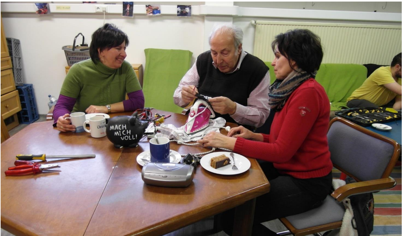
Fig. 2: Repair café in the OTELO open technology lab Vorchdorf, Austria

risky if subsidies are reduced or withdrawn, public programmes are terminated, or decision makers change. Social entrepreneurship continues to be a marginal issue in social and economic policy which is reflected in a low degree of institutionalisation and sometimes even in contradictory political signals.