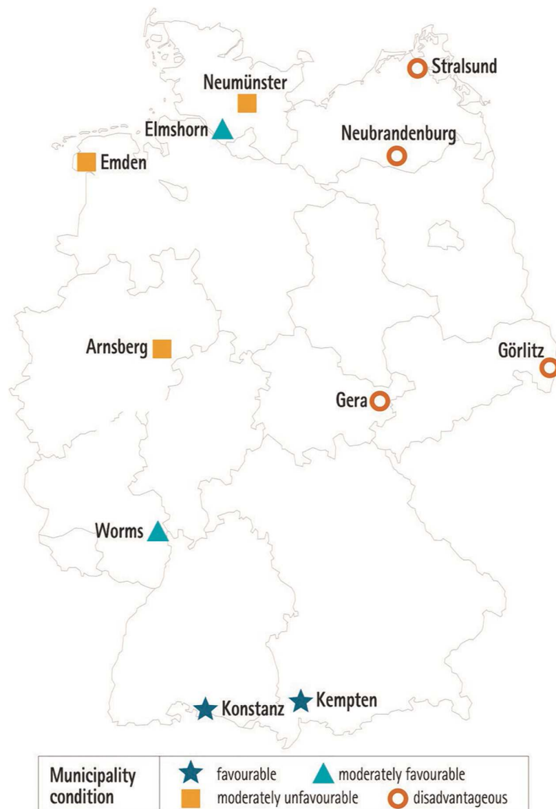
Figure 1. Location and our assessment of structural conditions for the 11 case study towns.

more than one individual, we did not glean much extra information from these additional interviews. We therefore reached data saturation for each case fairly quickly.